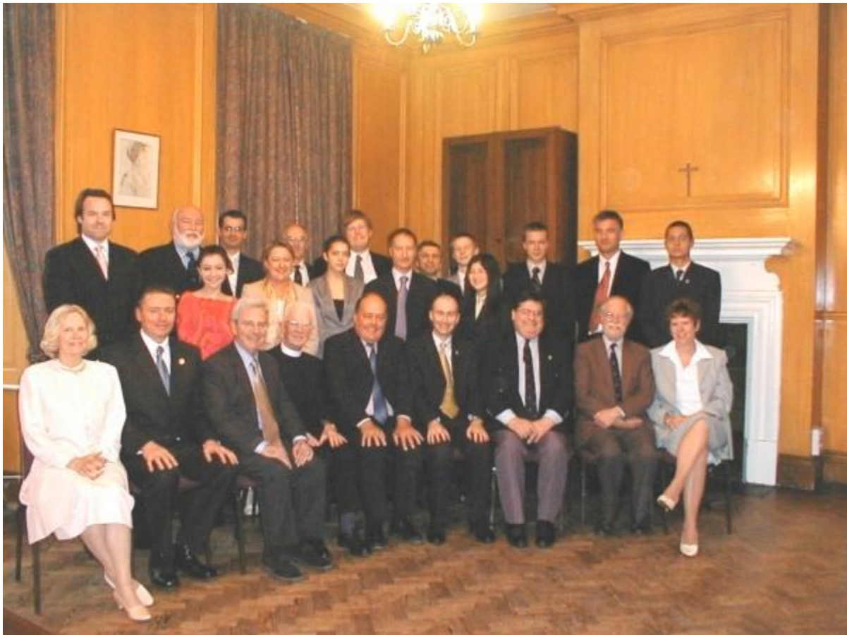
The Committee – May 2004